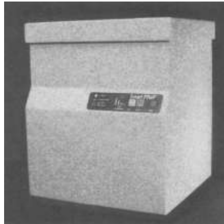
FIG. 1 . Automated platelet concentrate system

This obviously represents a significant additional expense and an inconvenience. A new tabletop autologous platelet concentrate system automated centrifuge, has recently been introduced; it is designed to be used intra operatively for the simple and rapid preparation of platelet-rich and platelet-poor plasma from a relatively small sample of blood 14,15 (Fig. 1). Operating room personnel, without the need for an additional technician, can easily operate the system. It requires 90 to 180 cc of blood versus the 500 cc of blood used in most autotransfusion machines. The platelet-poor plasma has a relatively high concentration of fibrinogen and can be used to prepare autologous fibrin glue. The platelet-rich plasma, as mentioned above, is useful for its high levels of growth factors and can be used to prepare autologous platelet gel. The purpose of this study was to evaluate the effectiveness of platelet-rich and platelet-poor plasma prepared with the automated system in achieving and maintaining hemostasis during cosmetic surgical procedures.