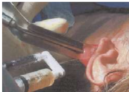
FIG. 3. Fibrin glue being applied to the surgical field by a dual syringe method.

Next, the circulating nurse prepared a thrombin-calcium chloride solution using 5000 units of thrombin dissolved in 5cc of 10% calcium chloride. The solution was then transferred by syringe into a sterile cup on the instrument tray in the sterile field. The platelet-poor plasma and calcium thrombin solution was then available for the scrub nurse to use in preparing autologous fibrin glue when needed during the procedure. The preparation of the fibrin glue requires a 10:1 ratio of platelet-poor plasma to thrombin-calcium chloride solution. The easiest method to deliver the plasma and thrombin product is by dual syringe with the platelet poor plasma drawn into a 10cc syringe and the thrombin-calcium solution into a 1cc syringe. The two syringes are then connected to a dual spray applicator tip and then sprayed onto the surgical bed. The platelet-poor plasma and thrombin-calcium cannot be combined before being applied in that they gel almost instantaneously, and their application is very difficult once they have gelled. The dual syringe method allows both solutions to be mixed as they are administered into the surgical bed (Fig. 3). This same dual syringe method is also used for the application of autologous platelet gel, simply substituting platelet-rich plasma for platelet-poor plasma.