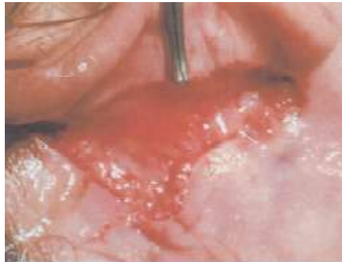
Fig. 4. Surgical field with a layer of platelet gel applied. Note the “carpeted bed” appearance

For each patient the type of surgical procedure, the average area of the capillary bed under the flap in each case, and the volume of platelet-poor and platelet-rich plasma prepared were recorded. Once adequate hemostasis had been obtained, and just before closure, each surgical bed was sprayed with platelet-poor plasma/calcium-thrombin. The area was observed to determine time required for a seal to form and all capillary bleeding to cease. After the bleeding was determined to have stopped, the area was observed for an additional 3 minutes before it was judged to be effectively sealed by the platelet-poor plasma/calcium thrombin solution. Just before closure, a layer of platelet gel was applied creating a “carpeted bed” effect (Fig. 4) so as to take advantage of the wound healing properties and the quicker healing time associated with the use of plate let gel. Using gentle pressure on the operative area, any surplus fibrin glue and platelet gel was pressed out. No drains were used in any of the patients.